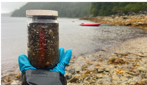
Figure 3. A jar of oiled sediment collected from the intertidal zone of Eleanor Island in Prince William Sound, September 2024.