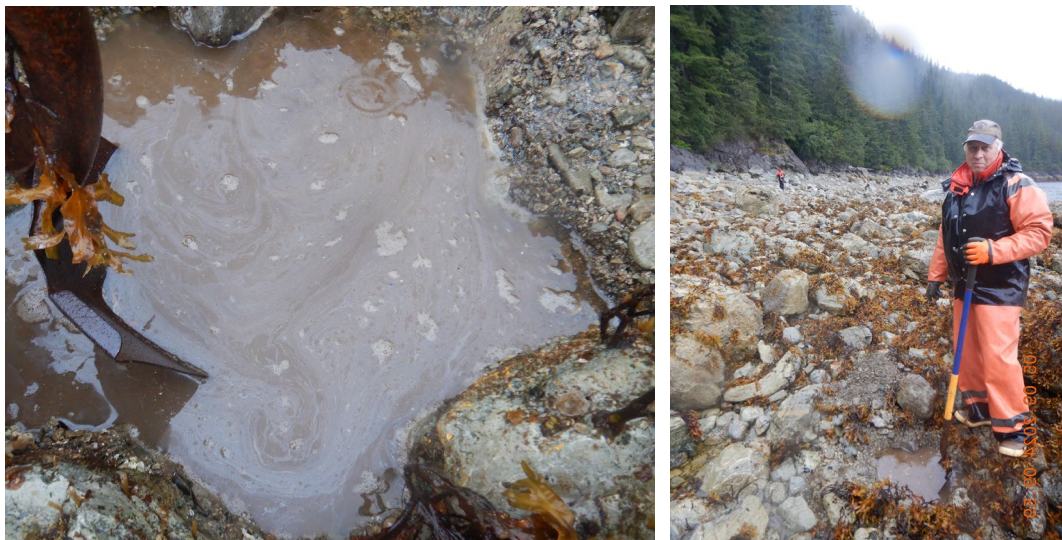
Figure 2. Dr. Dan Monson digging a pit in search of lingering Exxon Valdez oil in Prince William Sound, September 2024 (right). The left panel is a photo of a pit on Eleanor Island showing sheening resulting from excavation of oiled sediment.