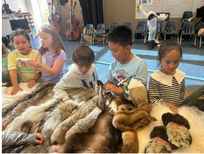
Figure 2.1: Cordova Culture Week Fur Presentation