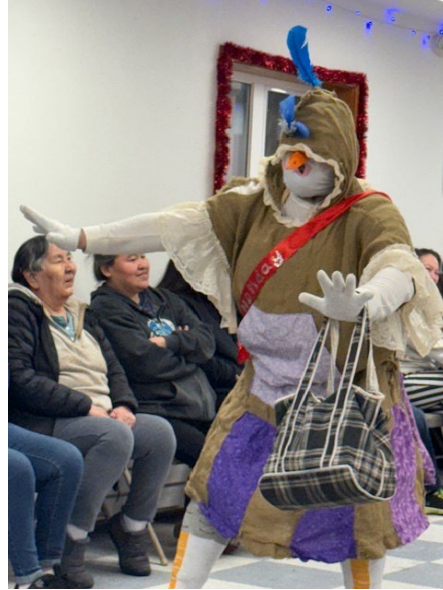
Figure 3.1: Port Graham Culture Camp “Snuikutem” Celebration