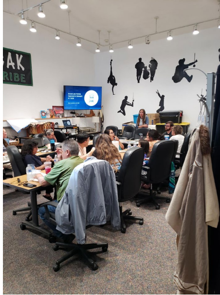
Figure 5.1: Seward Culture Camp Presentations