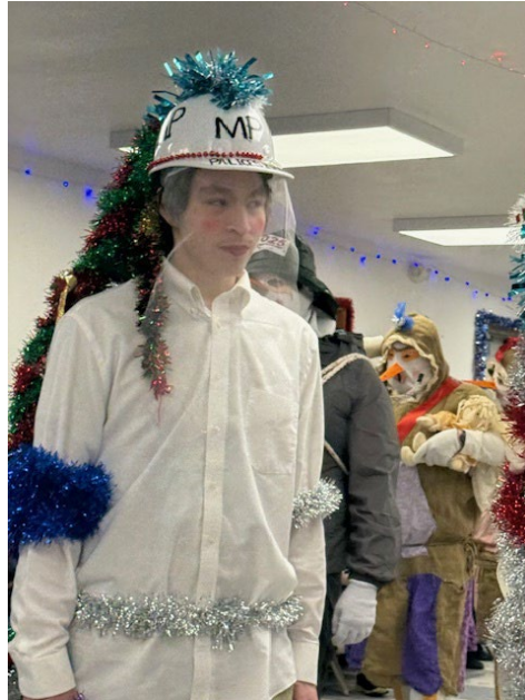
Figure 3.2: Port Graham Culture Camp Orthodox New Year Celebration