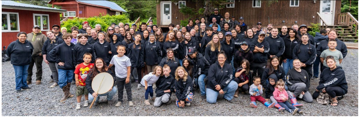
Figure 1.1: Nuuciq Spirit Camp 2025 Group Photo