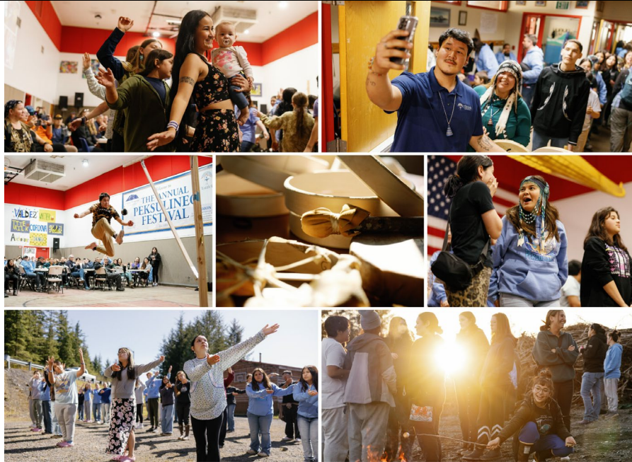
Figure 6.1: Tatitlek Peksulineq Cultural Heritage Week