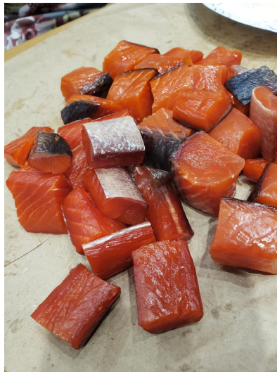
Figure 5.2: Seward Culture Camp Subsistence