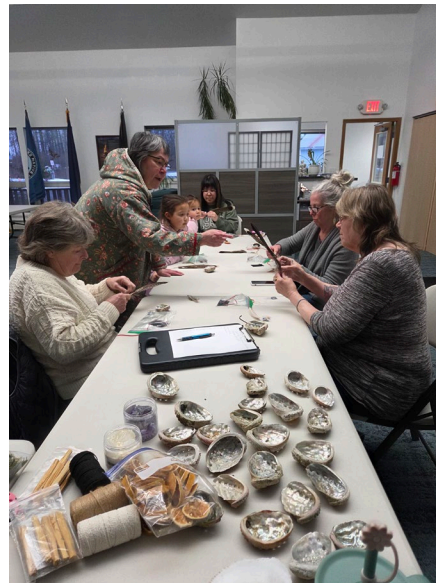
Figure 4.2: Valdez Culture Camp Crafting 2