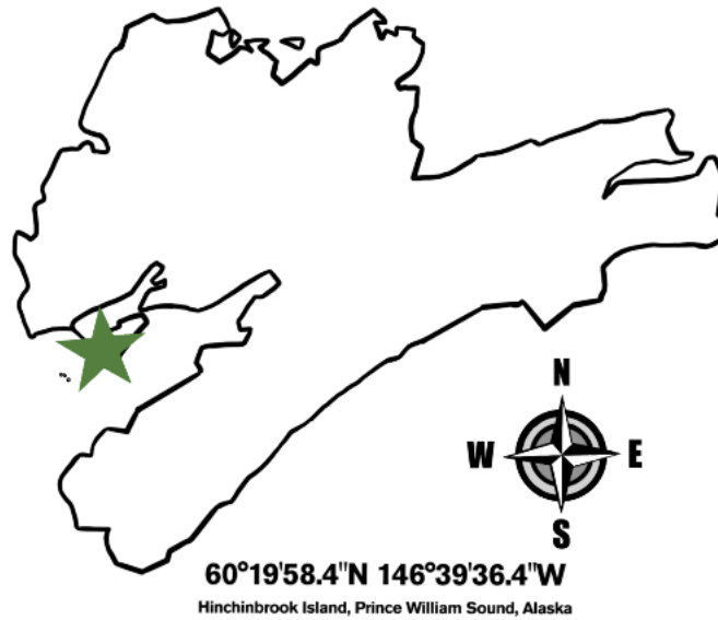
Figure 1.2: Nuuciq Spirit Camp 2025 Logo