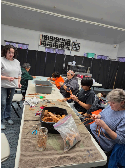
Figure 4.1: Valdez Culture Camp Crafting 1