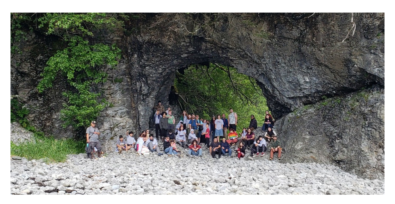
Figure 1.1: Nuuciq Spirit Camp 2023 Group photo