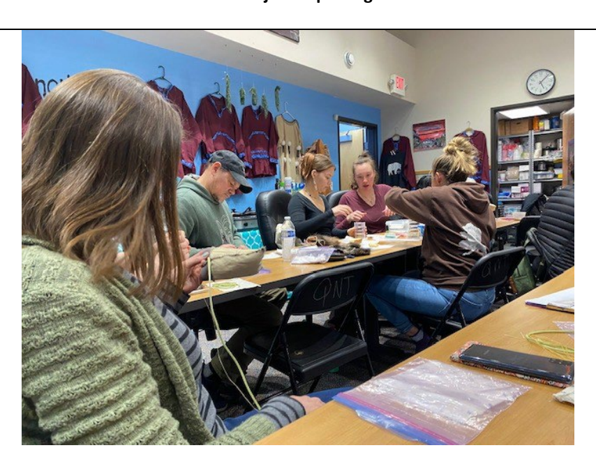
2.1 Seward Community Cultural Event group