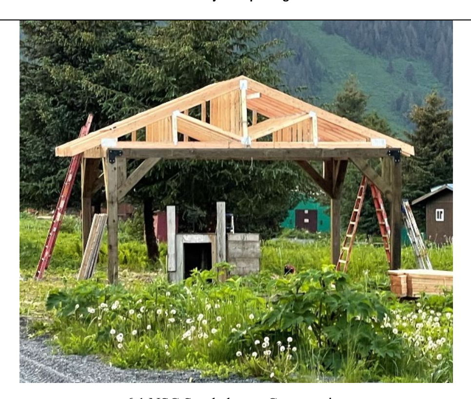
6.1 NSC Smokehouse Construction