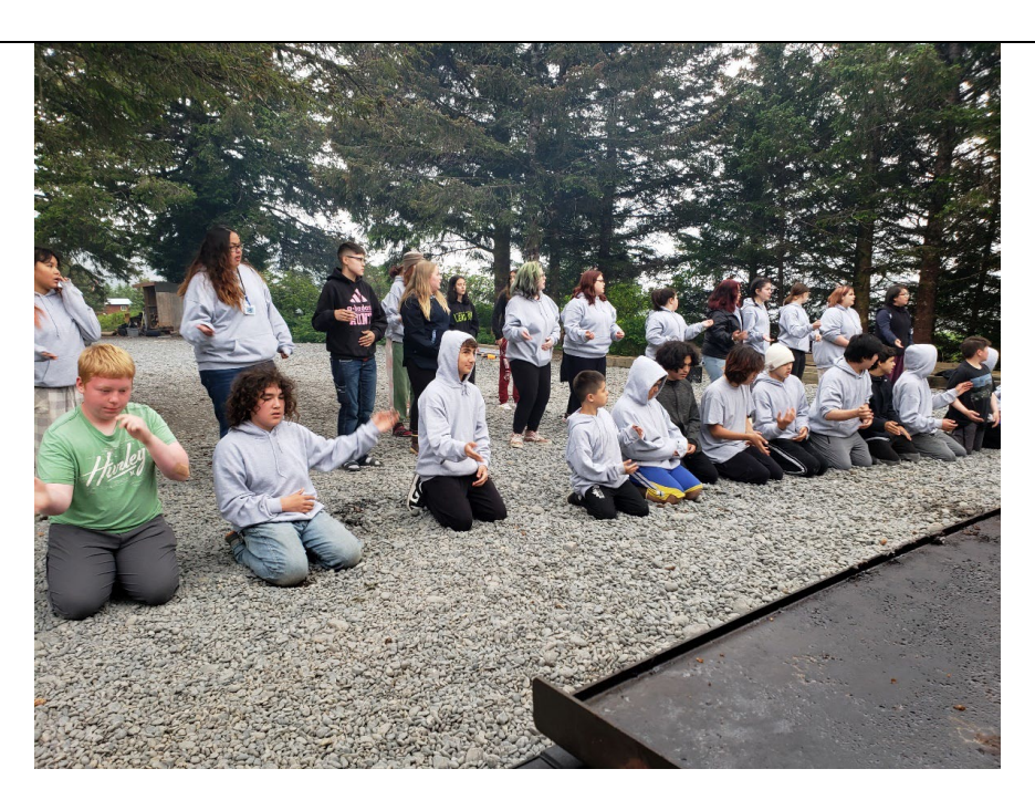
1.3 Nuuciq Spirit Camp 2023 Traditional Dance Performance