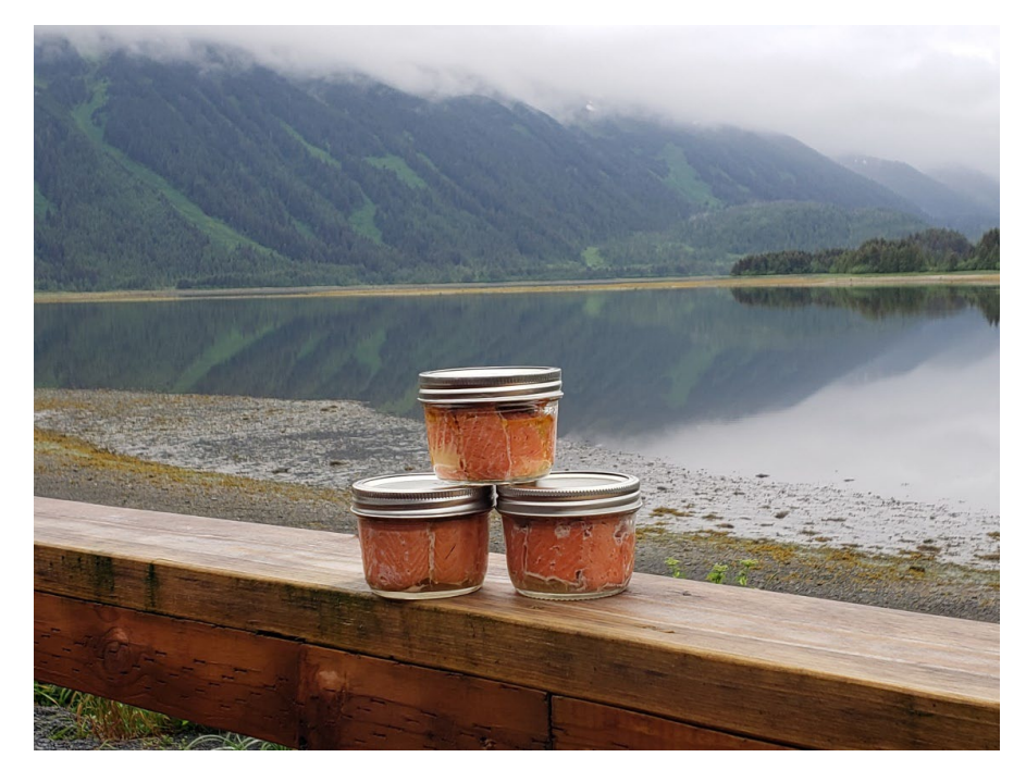
1.4 Nuuciq Spirit Camp 2023 Subsistence Class Jarred Salmon