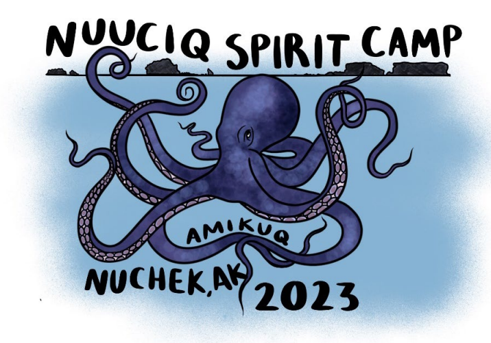
Figure 1.2: Nuuciq Spirit Camp 2023 Logo