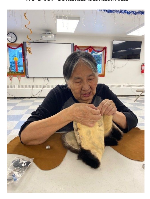
4.2 Port Graham Snuikutem workshop