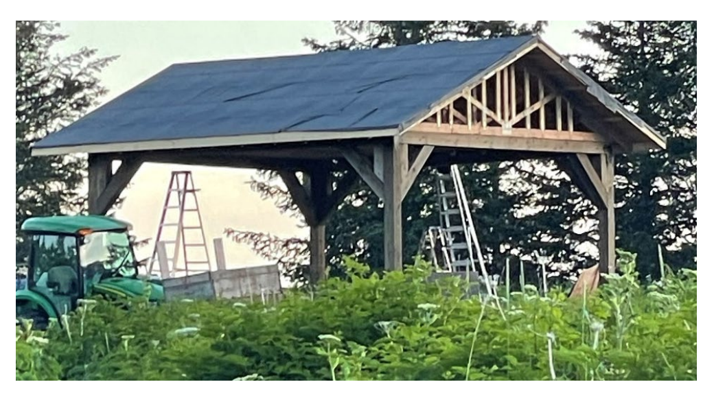
6.2 NSC Smokehouse Construction 2