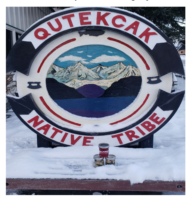
2.2 Seward Community Cultural Event QNT