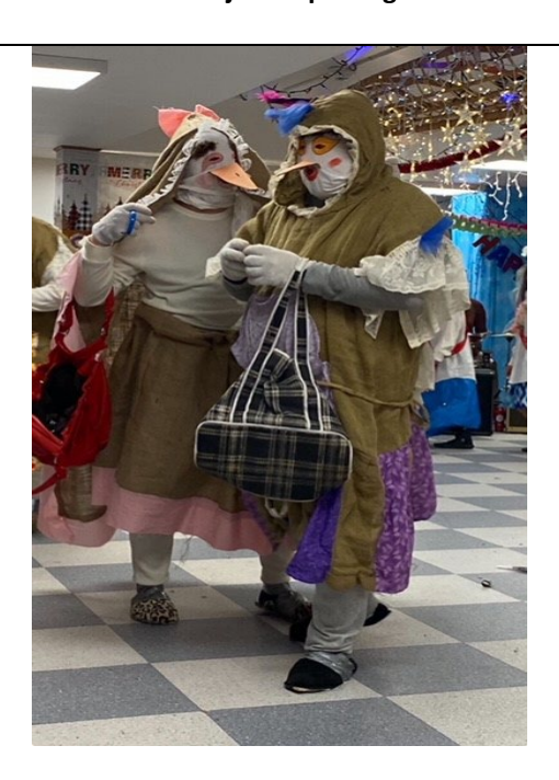
4.1 Port Graham Snuikutem