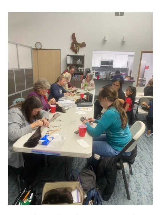
3.1 Valdez Cultural Event Group Photo 1