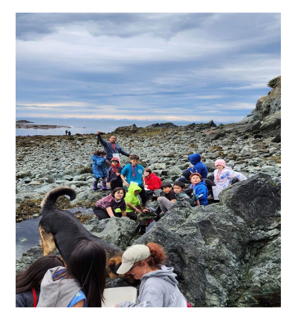
5.2 Nanwalek Sea Week scavenger hunt