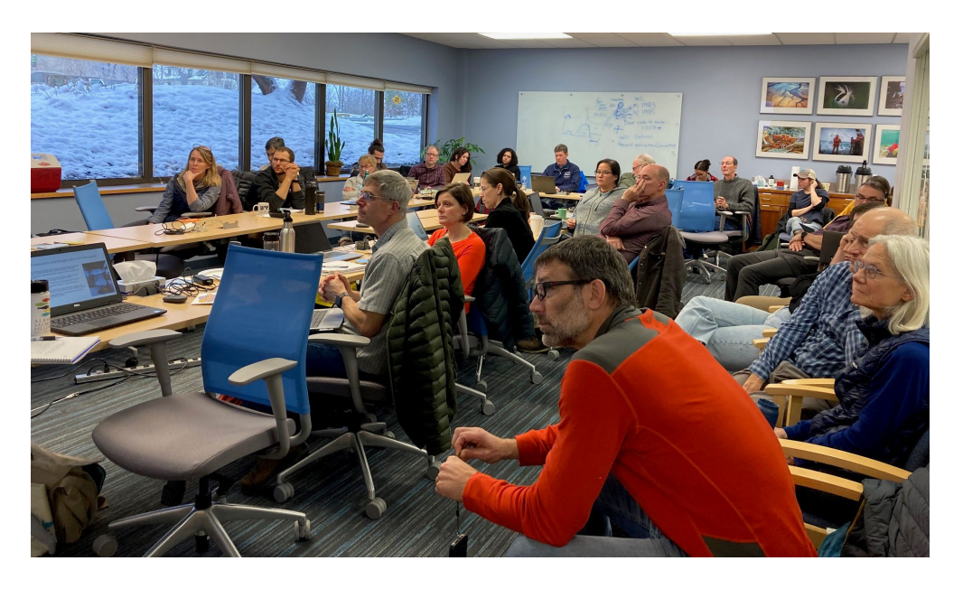
Figure 2. Gulf Watch Alaska Long-Term Research and Monitoring team members attend a principal investigators' meeting in November 2023 in downtown Anchorage, Alaska.

program, and discussion. A planned spring videoconference during 2023 was not conducted because of other demands on the limited PMT.