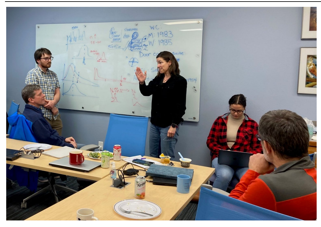
Figure 3. Breaks during the November 2023 Gulf Watch Alaska Long-Term Research and Monitoring principal investigators' meeting included productive discussions between project team members and Science Review Panel members.