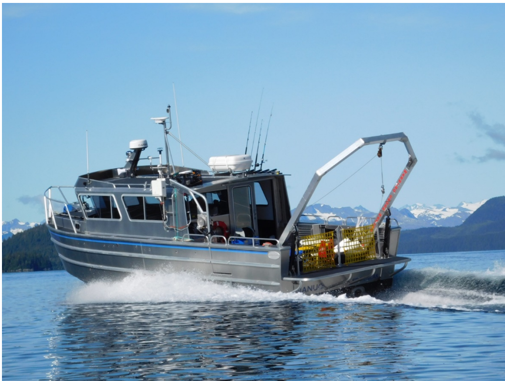
Figure 2. The R/V Nanuq, GAK-1's new support vessel.