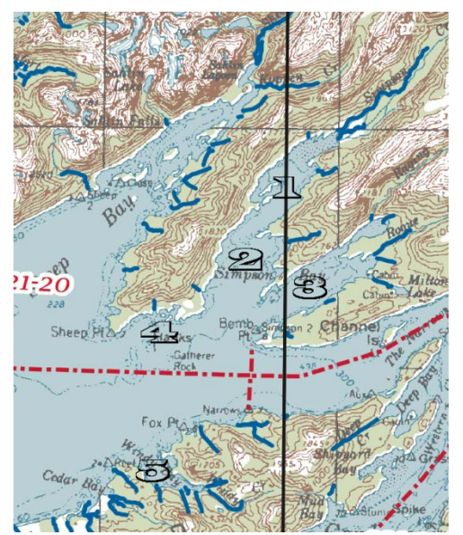
Figure 1. Map of Simpson Bay and surrounding waters showing five sampling areas.

The experimental design of the ongoing monitoring, i.e., sampling during November and March is a good match with respect to the experimental results used to develop the overwinter mortality model (Kline and Campbell 2011). The overwinter mortality model is based, in part, on a laboratory energy loss experiment that was conducted from 1 December to 25 January (Paul and Paul 1998). Therefore, measuring initial conditions during November is a good match. As well, one Paul and Paul (1998) experiment ended on 1 April, a good match to our field observations made in late March.