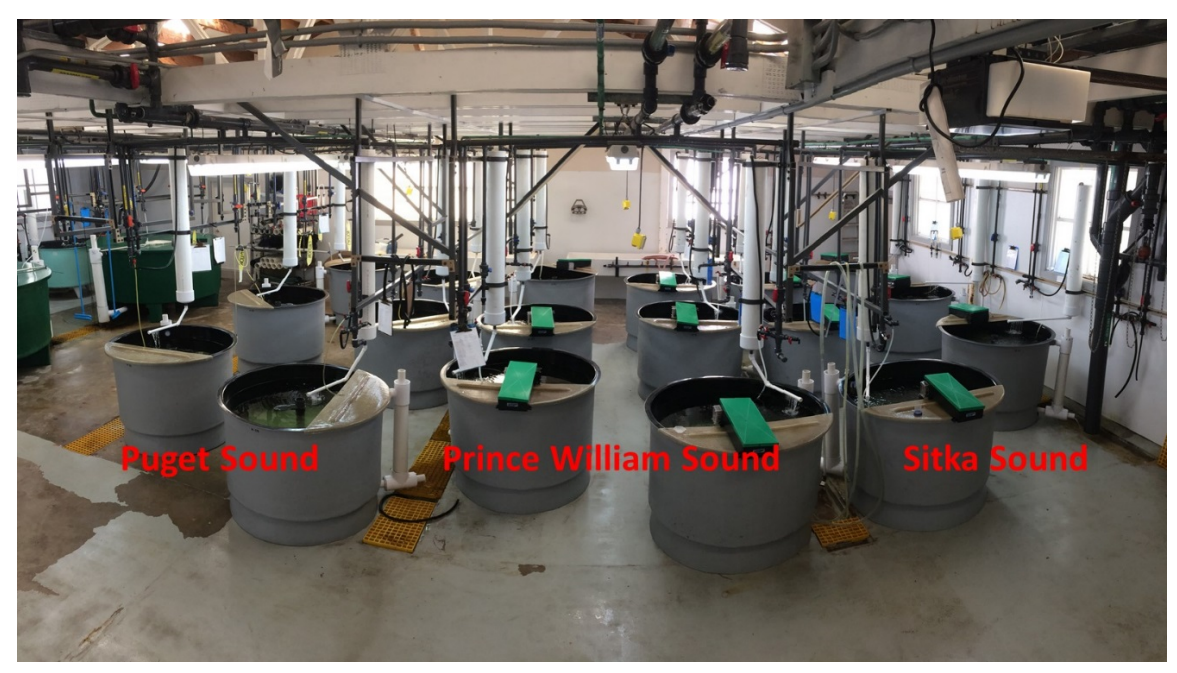
Figure 3. Footprint of the 18 grow-out tanks for oil-exposed herring, including duplicate tanks for unexposed, medium-low oil, and medium-high oil exposures for each stock (PWS, Sitka Sound, and Puget Sound).