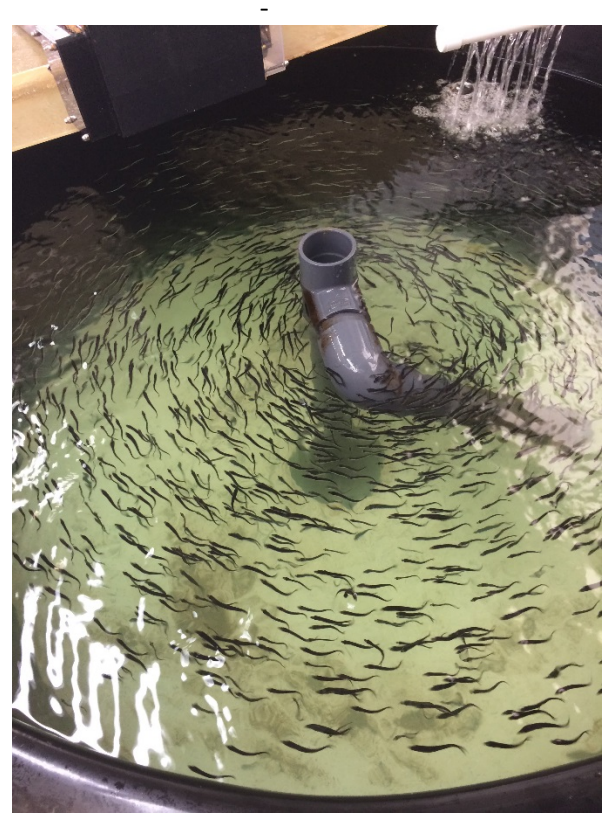
Figure 4. Oil-exposed specific pathogen-free Pacific herring in one of the 18 tanks depicted in Figure 1 (Sitka Sound, medium-high oil exposure).