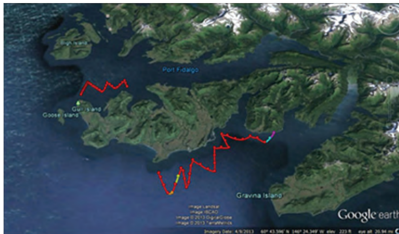
Figure 1. Examples of typical, zig-zag transects in Fidalgo and Gravina Bays in eastern Prince William Sound. The locations of these transects in any given year are based on plane and ship reconnaissance to determine the distribution of the spawning population.

Currently the PWSSC has digital echosounder systems that are well-matched to our needs. Our echosounders are DTX BioSonics systems ( www.biosonicsinc.com/product-dtx-portable-echosounder.asp ). We have two digital transducers that are capable of meeting our survey needs: a single-beam 70 kHz transducer, and a split-beam 120 kHz transducer. While the former is not capable of determining position of targets off the axis beam, it can be used to produce reliable biomass estimates through echo integration. This is the unit that has been used in the PWS surveys since 2002 (R. Thorne, pers. comm.). In 2012 the PWSSC acquired a split-beam 120 kHz DTX system, and we propose that this unit will be our primary echosounder for this survey. This system assures a more accurate calibration in the field, and can be used to track individuals through the beam, providing an opportunity for some additional insight into fish movement and behavior. We propose to run them simultaneously to compare their performance and assure consistency in this long-term data series. Further, having two systems allows us to conduct independent surveys off two separate vessels.