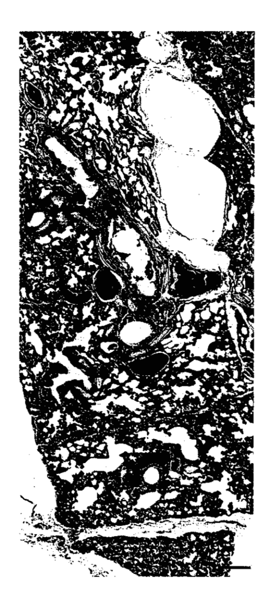
Figure 1. Lung: otter No. 11, interstitial emphysema.