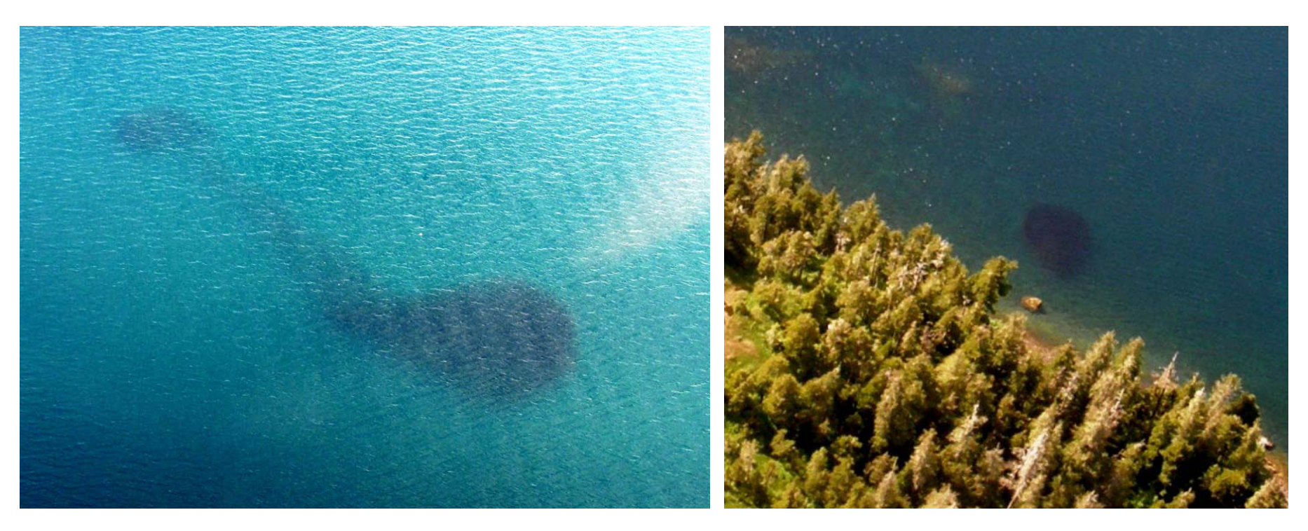
Figure 3. Adult herring schools in Knight Island Passage.

Figure 2. Age 1 herring at Zaikof Bay, Montague Island.