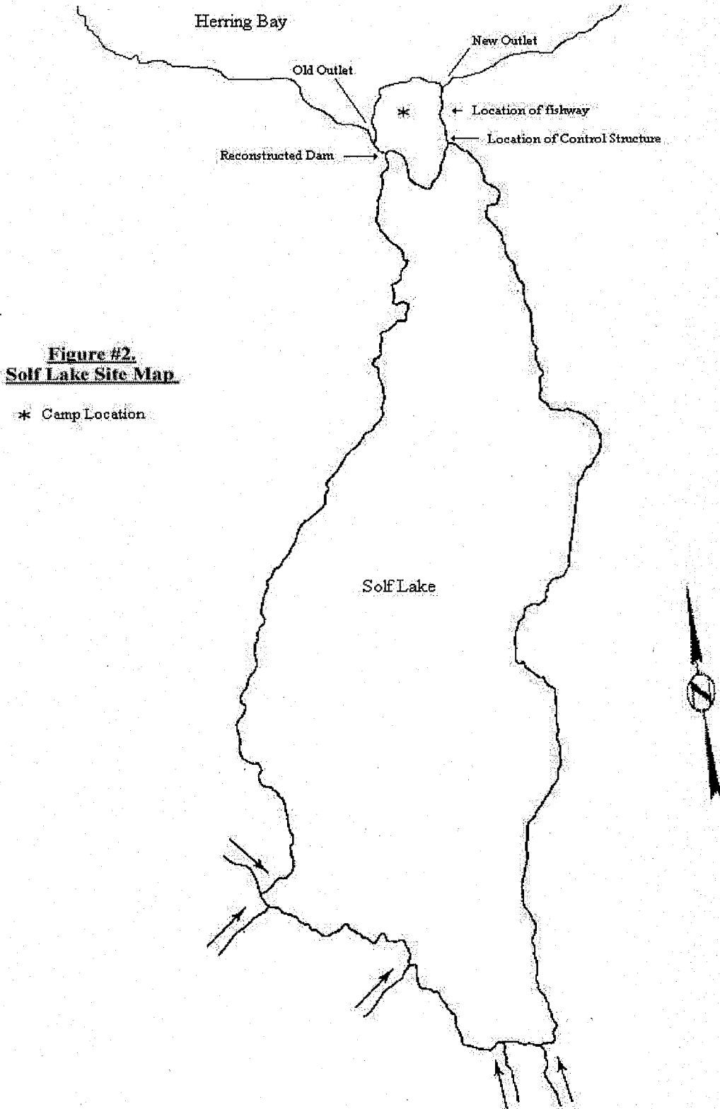
Figure 2. Site Plan