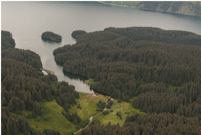
Photo: Mouth of Thorsheim Creek showing intact coastal forest