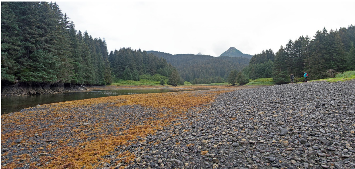
Photo: Mouth of Thorsheim Creek