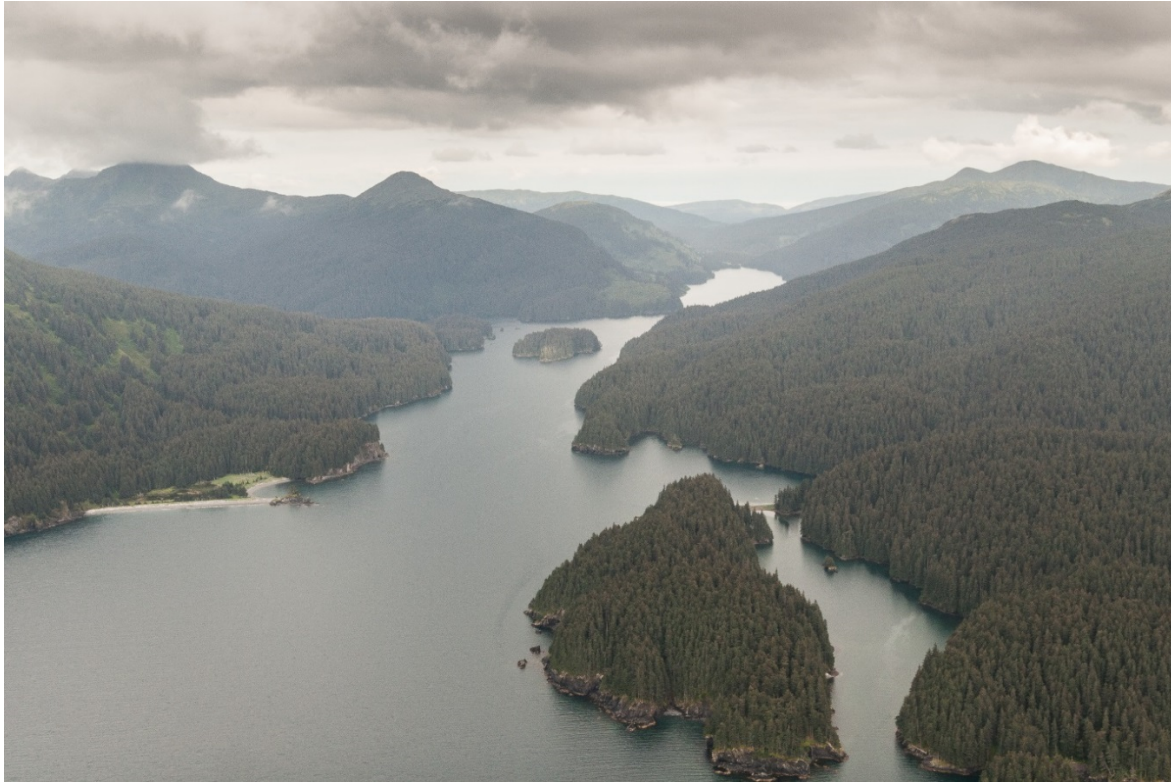
Photo: Thorsheim parcels (on right) showing proximity to the recent 2016 EVOSTC Ouzinkie Native Corporation acquisition (center).