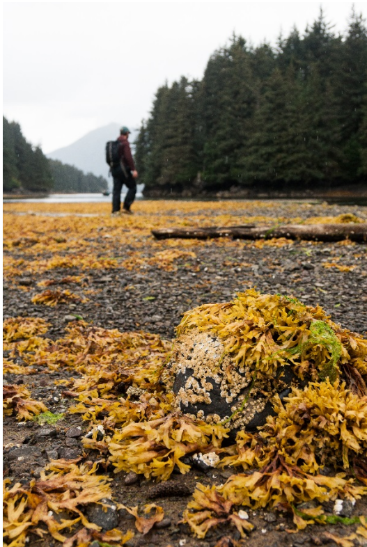
Photo: Mouth of Thorsheim Creek