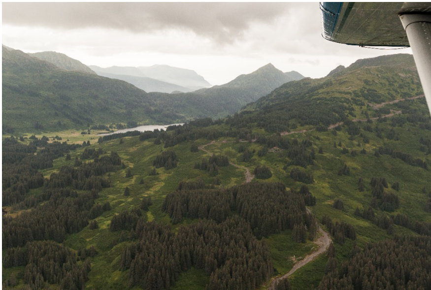
Photo: Logging road built to the edge of the subject property