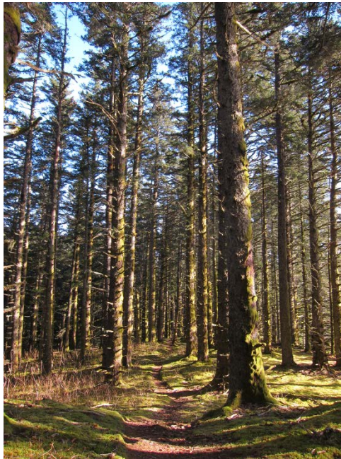
Photo: Trail and coastal forest habitat