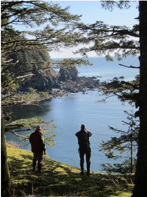
Photo: Termination Point coast