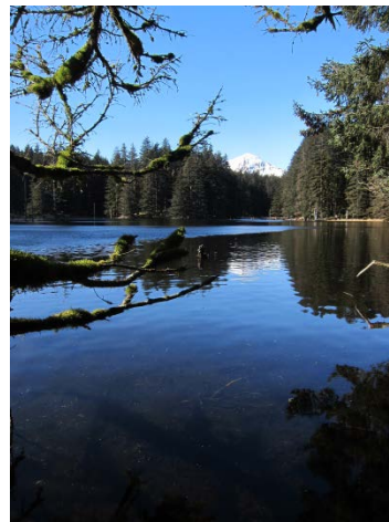
Photo: Coastal forest and wetland habitat