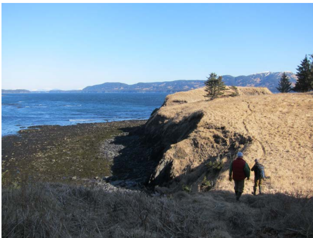
Photo: Termination Point and coastal wetlands