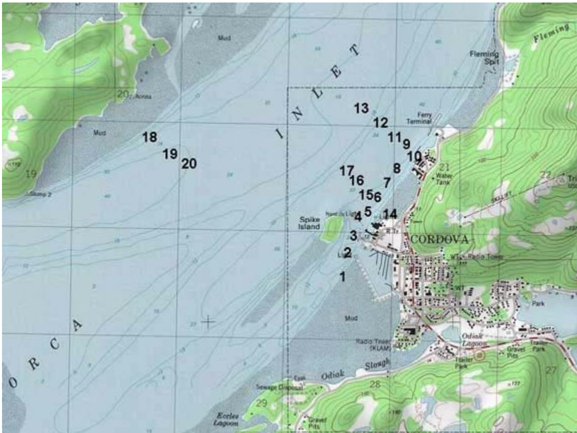
Figure 2. Map of sample locations from Williams et al. (1999). Stations 18-20 are control stations. Additional control observations have been added north of this map off Observation Island.

Efforts for the remainder of this first year will be to complete the baseline measurements in late August, conduct the two workshops and develop the experimental plan for years two and three. It is anticipated that the bulk of the measurements and experiments to be conducted over the next two years will focus on the July/August time period.