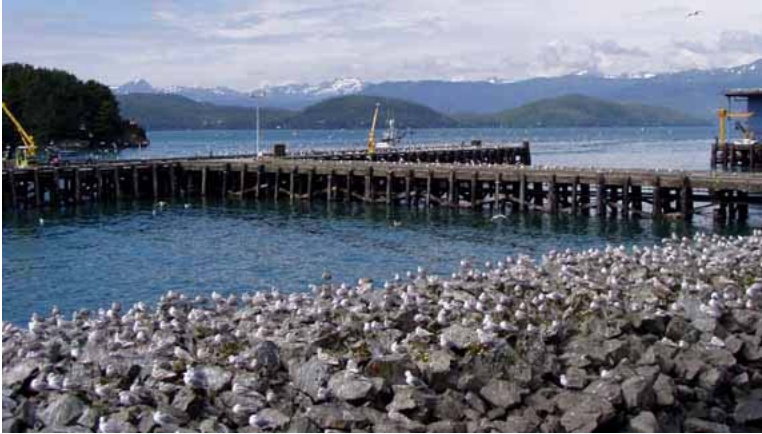
Figure 3. Typical high gull abundance during peak pink salmon processing. As the nesting season concludes in late June, thousands of Glaucous-winged gulls are visible in and around the Cordova canneries, including on rooftops, docks, and breakwaters.

community as evidenced by the draft list of invitees to the planning workshops (Appendix 1).