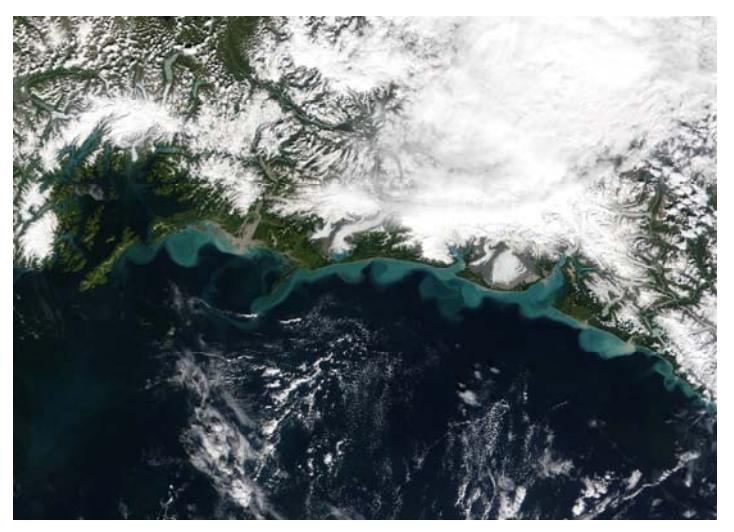
Figure 3: MODIS image of southcentral Alaska taken August 22, 2003. Sediment loading from freshwater input is visible as a band along the coast.

An estuarine front occurs during summer and autumn near the mouth of Valdez Arm (Muench and Schmidt 1975; Vaughan et al. 2001; Okkonen et al. 2005). Okkonen et al. (2005) observed a front at Hinchinbrook entrance; satellite images (fig. 3) and personal observations from small aircraft show that there are sometimes different water masses on the western and eastern side of the entrance. The eastern side is usually turbid and makes up coastally trapped fresh water, including the outflow of the Copper River. The western side can be made up of outflowing PWS water; reflux events (where water crosses the entrance without necessarily entering PWS) also