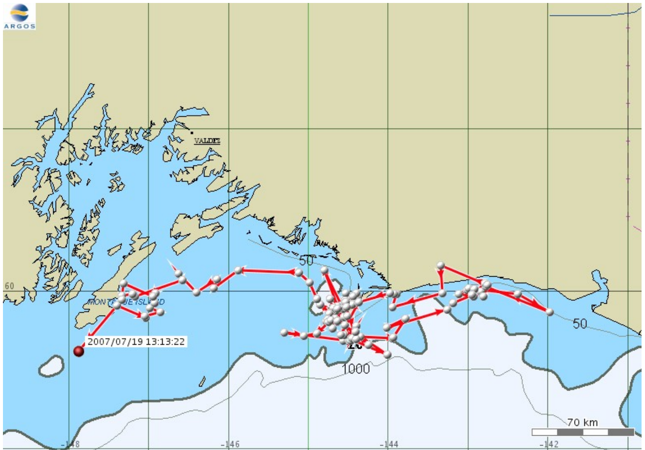
Figure 3. Trackline of Gulf of Alaska transient (mammal eating) killer whale AT109 who has covered over 300km of coastal waters in the 10-19 July period.